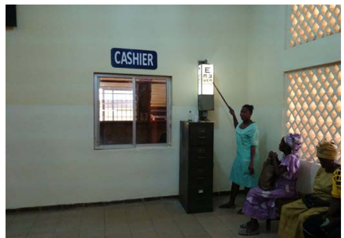
Picture 4: cashier area at Kissy Eye Hospital, after renovation.