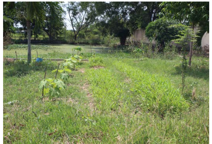
Figure 10: In order to protect local waterways and villages from hospital sewage and run-off water, a well designed sewage system has been constructed. This includes establishment of reed-bed pond. Fish have been added to eat mosquito larvae and other insects. Hospital staff use the area alongside the reed-bed to grow vegetables.