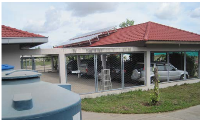
Figure 5: Car park with solar panel system on the roof. Single tube low energy fluorescent lights are used. For important equipment, the power supply is assured and also protected with an Uninterruptible Power Supply (UPS) unit.

The hospital has a 3.5 Kilowatt solar panel system provided by a donor to CBM. The battery pack is cooled by a single fan, to extend its lifespan. The solar panel system provides back-up and security lighting. If the hospital is able to access further grants, the size of the solar panel system will be increased.