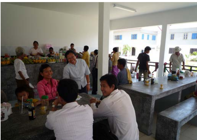
Figure 7: Staff meeting in open air restaurant area