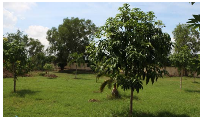
Figure 11: Trees and gardens surrounding the hospital create a cooler, more pleasant environment, and also provide fruit and timber.