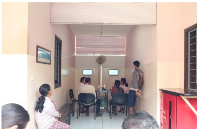
Figure 1: Visual Acuities are conducted in an open room with natural air-flow, rather than in a room with air-conditioning, consuming significant energy.

Climate change is predicted to be one of the largest global health threats of the 21st century. Health care itself is a large contributor to carbon emissions. As an example the carbon footprint of the National Health Service (NHS) in England is estimated at 20 million tonnes of greenhouse gases (GHGs) per annum, accounting for 25% of all public sector emissions in the United Kingdom. 1 We note that the NHS has put in place a Sustainable Development Management Plan, seeking to improve economic, social and environmental sustainability. The authors see it as essential that health services in all countries play their part in reducing carbon emissions and improving their overall environmental sustainability, as part of 'sustainable development'. 2