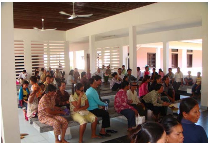
Figure 4: The outpatients waiting area remains cool and pleasant, thanks to natural ventilation and shaded windows.