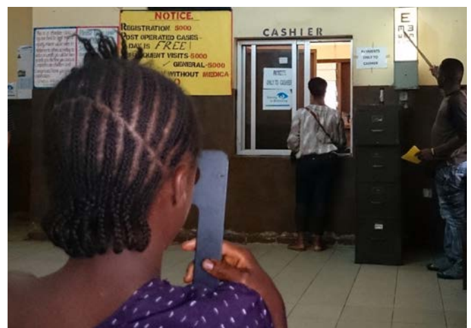
Picture 2: note the area in front of the cashier overloaded with difficult to read signs and posters before renovation (see the improvements in Picture 4).