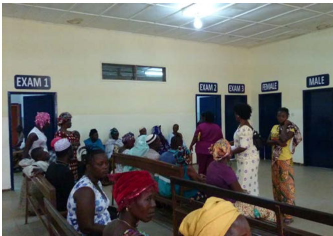
Picture 3: main waiting area of Kissy Eye Hospital after renovation.