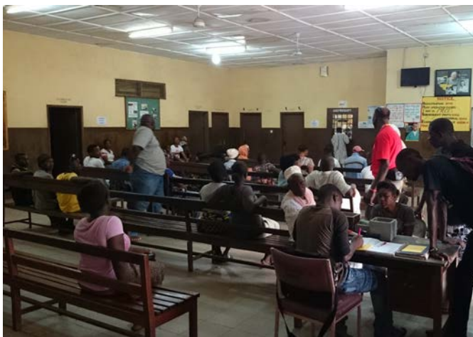
Picture 1: main waiting area of Kissy Eye Hospital before renovation (see the improvements in photo 3).

We are also delighted that Kissy Eye Hospital continued to operate through the period of extreme hardship caused by Ebola in Sierra Leone and the wider West African region. They now ensure that Ebola survivors receive needed treatment for resulting eye conditions, and also create links with community mental health programs and other services.