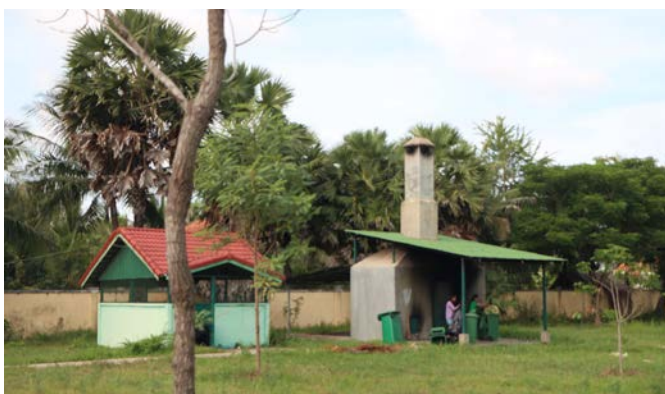
Figure 9: An incinerator in a locked compound ensures safe disposal of hospital waste, with minimal environmental risks and hazards to the local population.