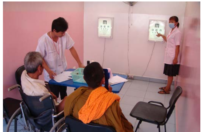
Caption 2: High quality inclusive practice for all people, ensures facilities are welcoming to people with disability and to those facing marginalisation for any other reason.