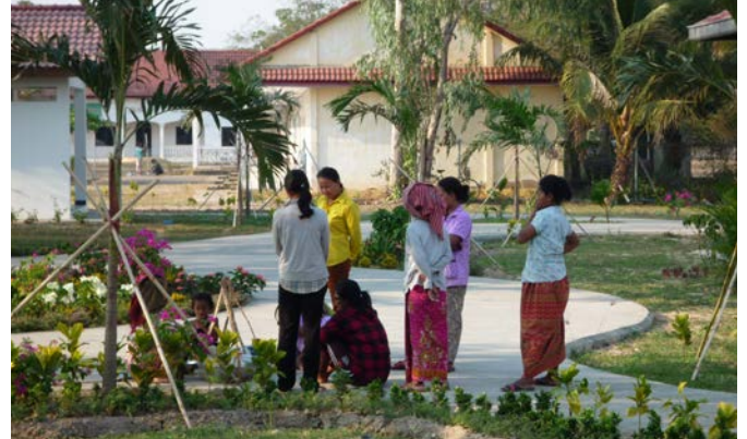
Caption 1: Trees and accessible green spaces create a pleasant environment, which is welcoming to all people.