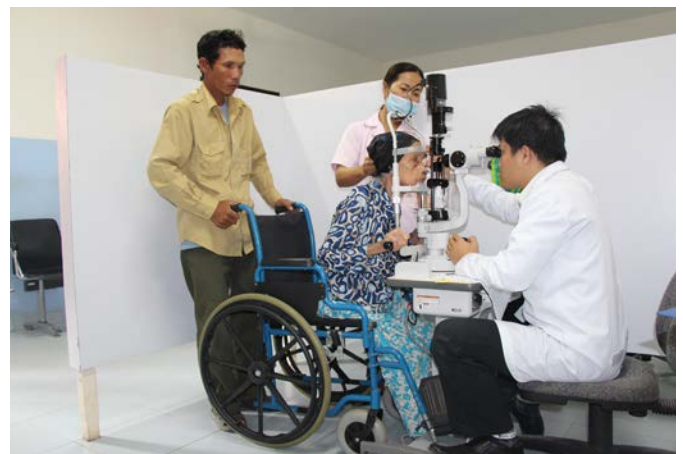
Figure 2: As well as seeking environmental sustainability, CTEH seeks to implement high quality disability inclusive practice.