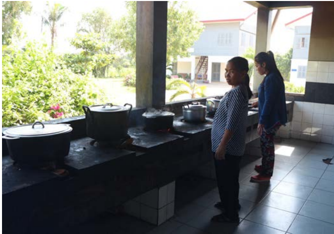
Figure 8: Accompanying persons of patients who have been admitted to the hospital, cook meals using “Lao stoves”.