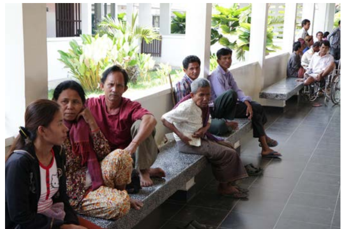
Figure 3: Open, airy verandahs allow for air movement, keeping the hospital cooler, and creating a pleasant environment for patients to wait.