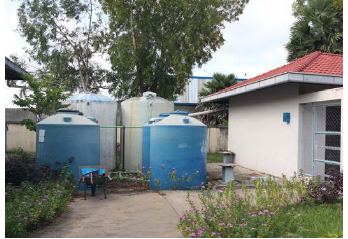
Figure 6: Some of the rain water collection tanks on site. Further storage is under ground, making a total of more than 100,000 litres. Inexpensive shading is provided for motor cycles.