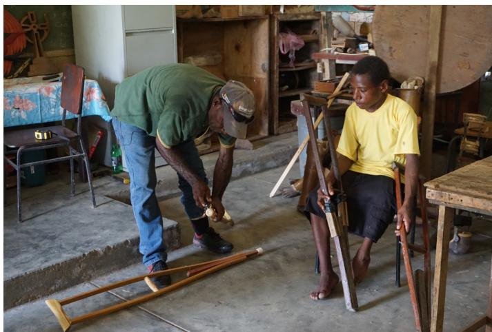
> Children with difficulty walking need access to mobility devices like wheelchairs and crutches to attend school

The Network of Callan Services for Persons with Disabilities is comprised of 19 Inclusive Education Resource Centres (IERCs). The IERCs are spread across cities and more rural areas of the country and are responsible for identifying and working directly with children and adults with disabilities in the community. These IERCs are established by Education Agencies that are approved by the National Education Board. There are two types of roles at the IERCs. These include community rehabilitation workers who receive wages through funding NGOs and qualified inclusive education teachers who receive their salary from the National Department of Education (NDoE). Both work to understand the needs of individuals and families and provide services under a CBID approach. The IERCs work with support and training from the Callan for Persons with Disabilities National Unit (CSNU), a faith based development NGO. As the lead and coordinating organisation within the Callan Network, CSNU provides capacity building for the IERCs and advocates to government for inclusive policy and funding commitments. The Callan Inclusive Education Institute (CIEI) and CSNU help conduct training for teachers across the Network and also mainstream teachers, to ensure that each child with disability has access to an education that fosters inclusion in society.