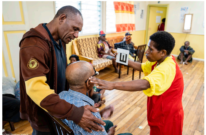
> Staff from the IERC conduct eye screening during a cataract surgical outreach clinic in the Highlands

The CBID approach in Papua New Guinea (PNG) is predominantly facilitated by the Network of Callan Services for Persons with Disabilities (Callan), the largest provider of disability services in PNG. For more than 28 years, Callan has been supporting children and adults with disabilities to access community based rehabilitation, access to education and advocating for inclusive development. Since PNG independence in 1975, church based organisations and NGOs have delivered a high percentage of education and other basic social services where government services were not yet sufficient to meet the need. Today, access to health and education continues to be limited by mountainous terrain and a lack of road networks and transportation, pointing to the necessity of community-based services like Callan's, to reach the rural population. As such, they are viewed as important development partners and are key stakeholders in national development plans. CBM have supported Callan since 1978, increasing the breadth and depth of services and trained personnel. Since 2011, funding from the NZ Aid Programme has enabled CBM-NZ projects to support the strengthening of inclusive education.