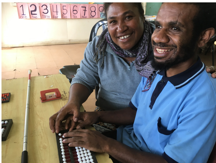
> An Inclusive Education teacher from the IERC teaches maths to a blind student

For the disability-specific interventions, staff at the IERCs use standardised case management tools to identify the need at an individual level and maximise the effectiveness of service delivery. The community rehabilitation workers use Case Management Plans (CMPs) and the inclusive education teachers use Individualised Education Plans (IEPs). These person-centred tools are used to collaborate with individuals and their families to agree on short and long term goals and work together to progress the achievement of these goals. Working together as a team on goals that are important to the person has helped generate successful outcomes. Data suggests that use of these tools is contributing to better health and functioning outcomes for children, youth and adults with disabilities, and better learning outcomes for children.