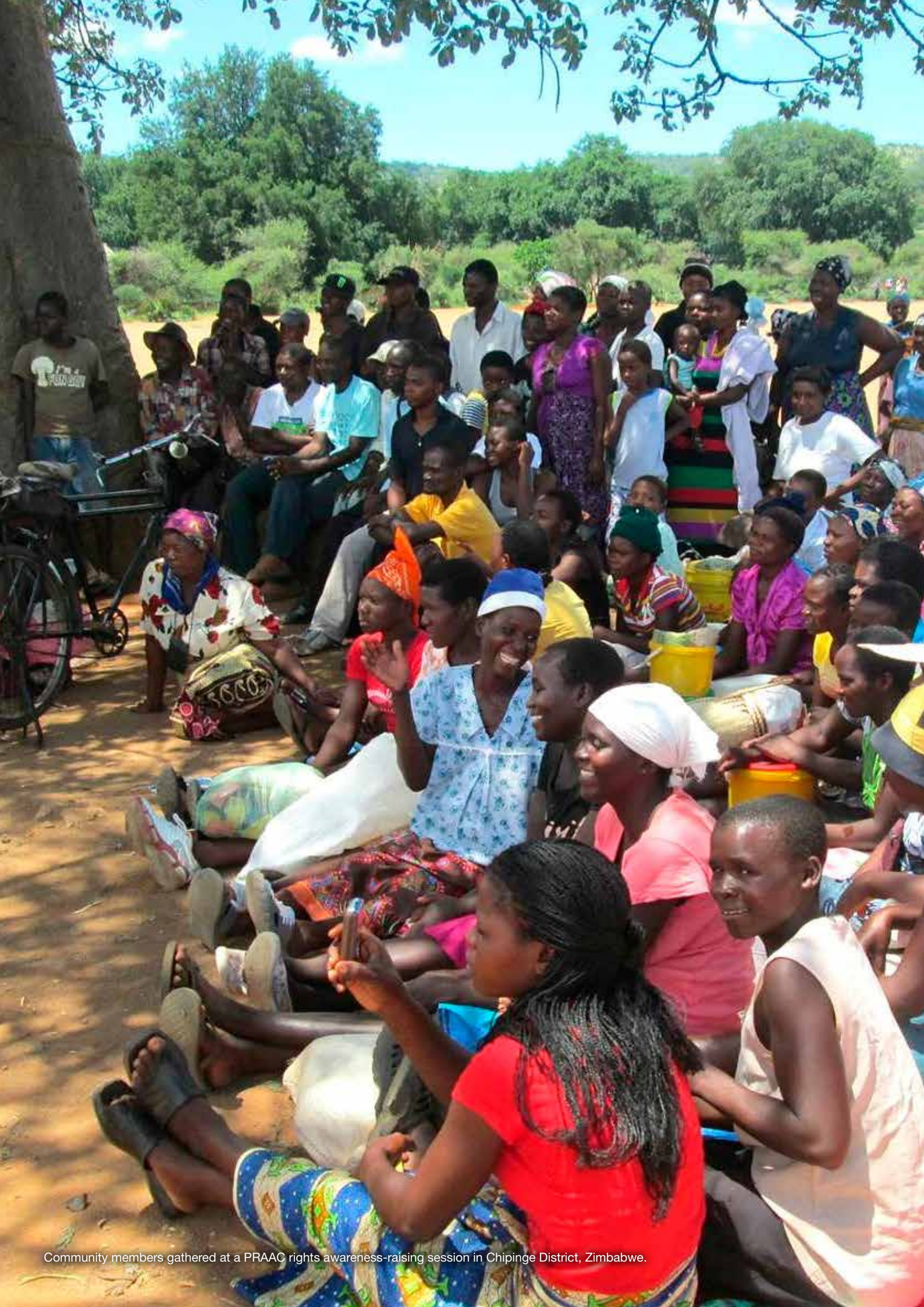
Community members gathered at a PRAAC rights awareness-raising session in Chipinge District, Zimbabwe.