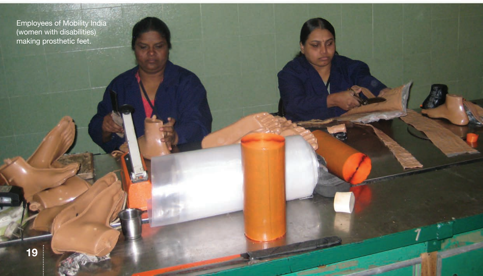
Employees of Mobility India (women with disabilities) making prosthetic feet.