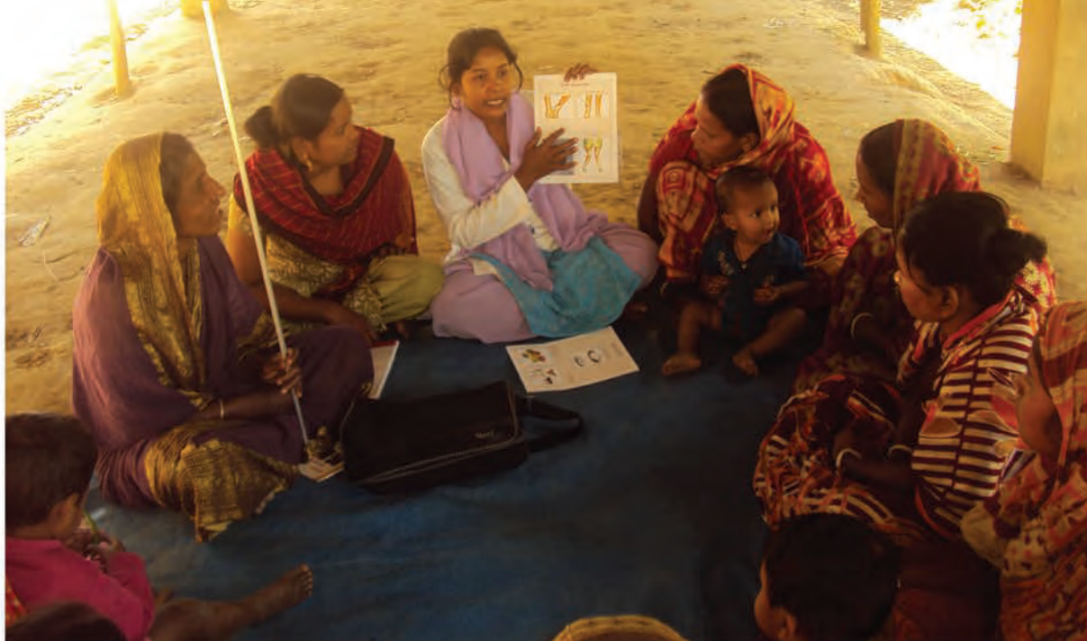
A local self help group undergoes training.