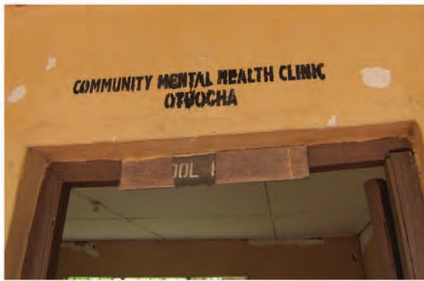
Community Mental Health Clinic