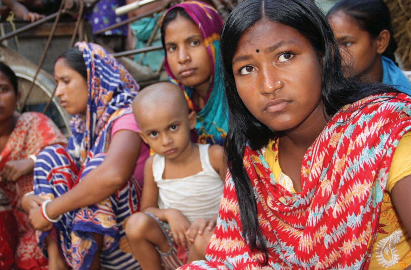
The General Secretary of Notun Jibon self help group in Gaibandha, Bangladesh.