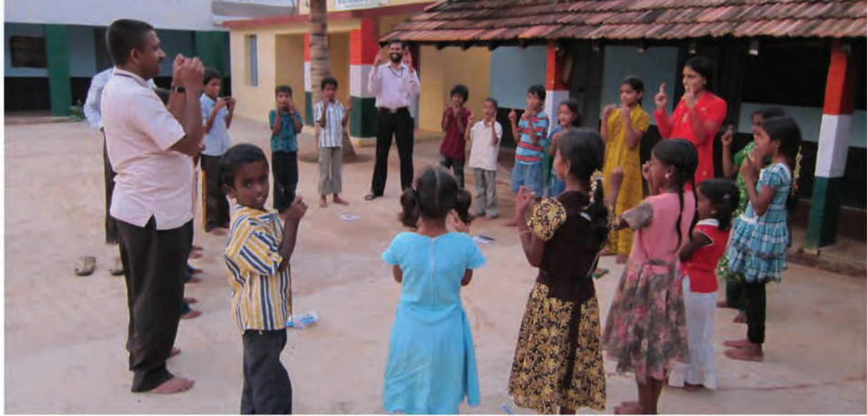
A meeting of the Kozhipalaya village Community Education Centre group.