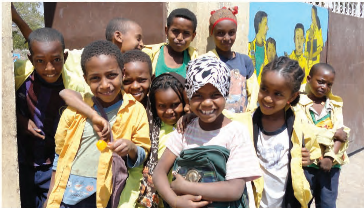
Children with and without disabilities at school together.