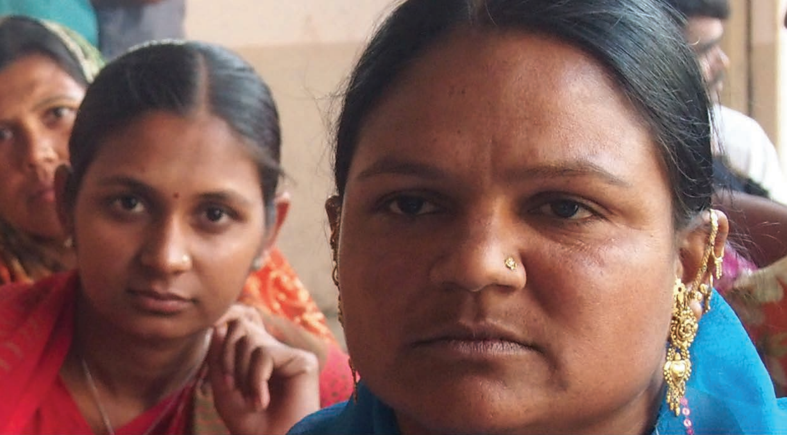
Inclusive self help group in Gujarat, India