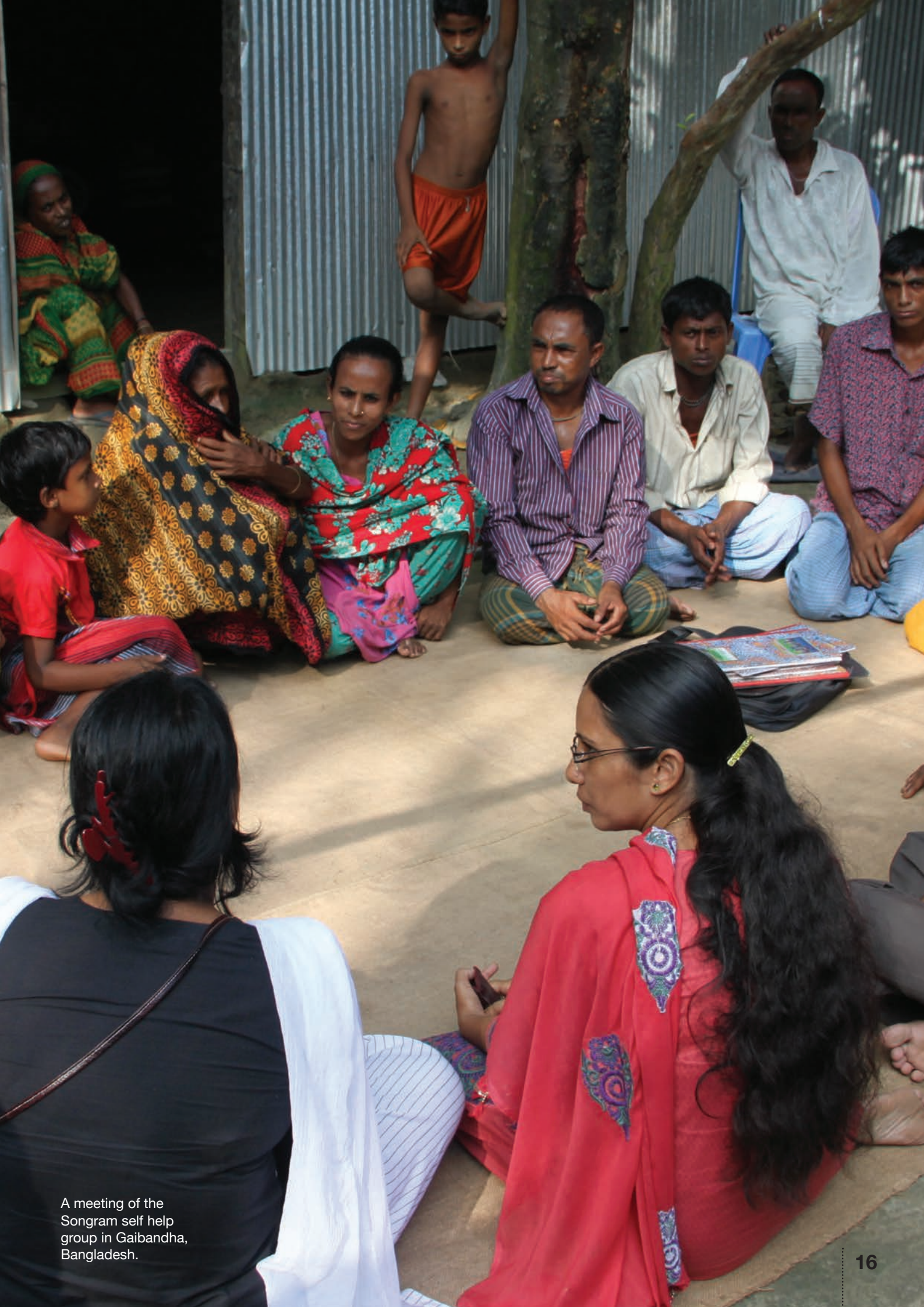
A meeting of the Songram self help group in Gaibandha, Bangladesh.