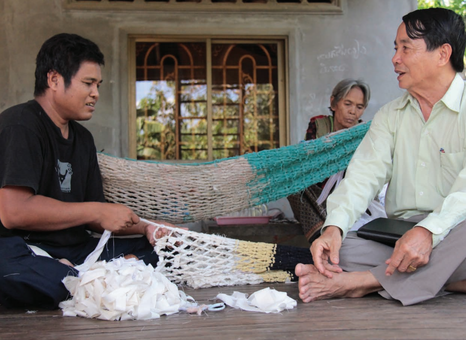
Producing hammocks as an income generation activity.