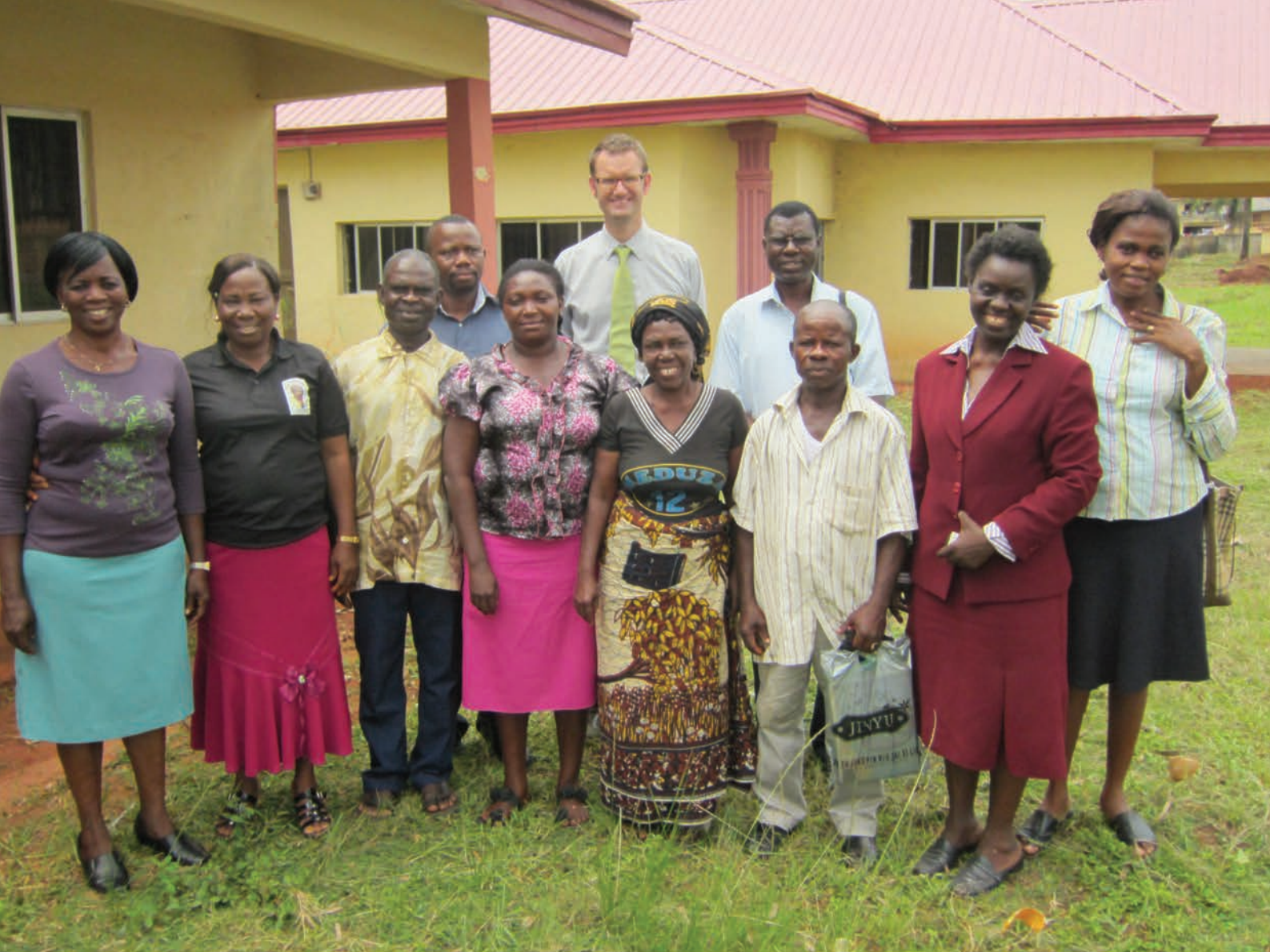
Community Mental Health Program nurse and field workers.