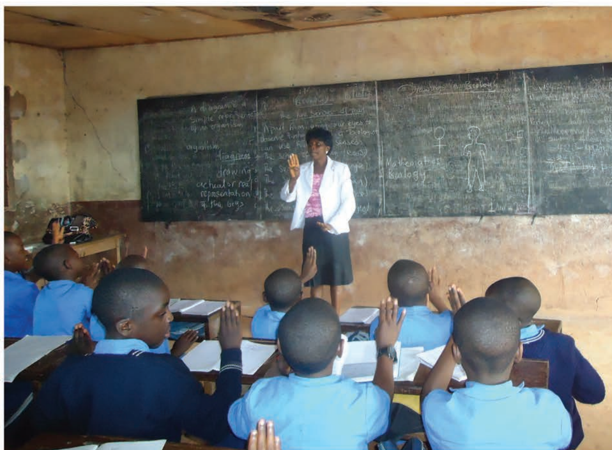
Sign language instructor teaching students sign language so that they can communicate with their peers.