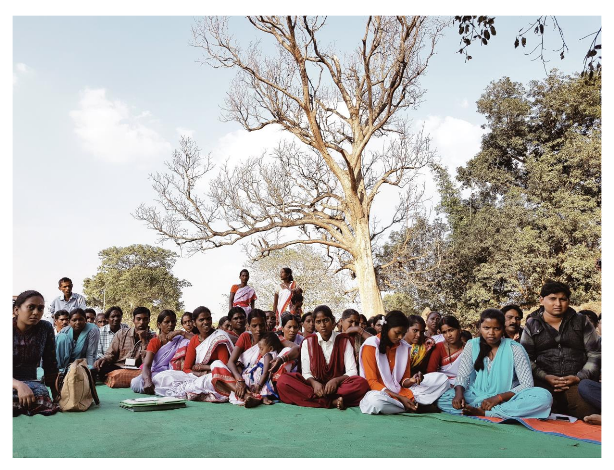
Community members in Jharkhand meet with CBM and local partner CSS. Participants include a fathers group recently formed thanks to the advocacy efforts of local women.